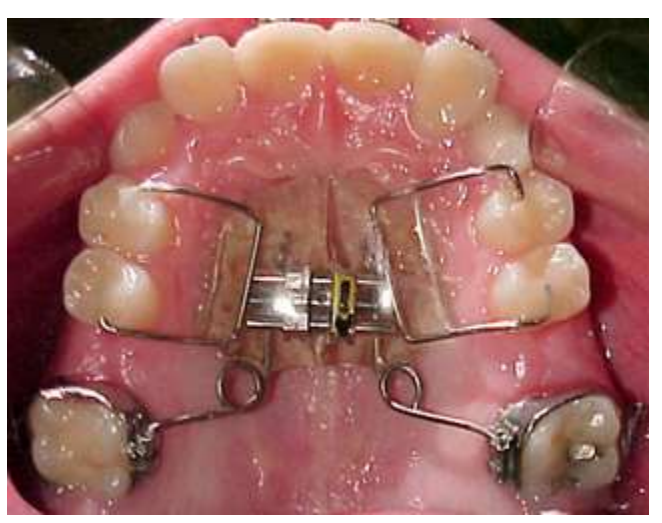
Figure 1. Occlusal view of the Pendex appliance positioned on the maxillary arch

All patients were treated with Pendex appliance similar to that described by Hilgers (1998)<sup>13</sup>. The appliances were made by the same technician and consisted of an acrylic Nance button with an expansion screw, distalization coil springs (0.032'' TMA wire), which were inserted into the lingual sheaths on the bands attached to the maxillary first molars, with occlusal supports adapted to the mesial marginal crest of the first premolar or deciduous molar, and distal from second premolar or deciduous molar (steel thread 0.08 mm) (Figure 1).