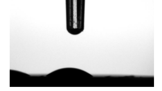
Figure 3. Contact angle values of the Ti specimens after electrochemical anodization treatment